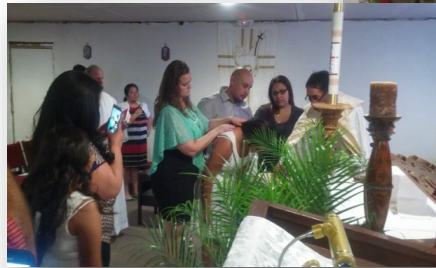
Easter Vigil Service with Baptisms