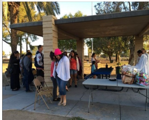
Easter Sunrise with Easter Egg Hunt for Children