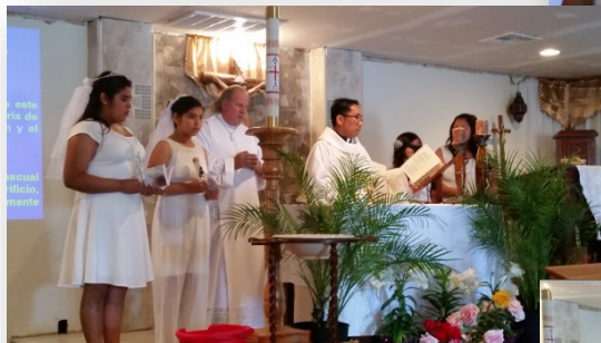
Easter Day Mass with First Holy Communion