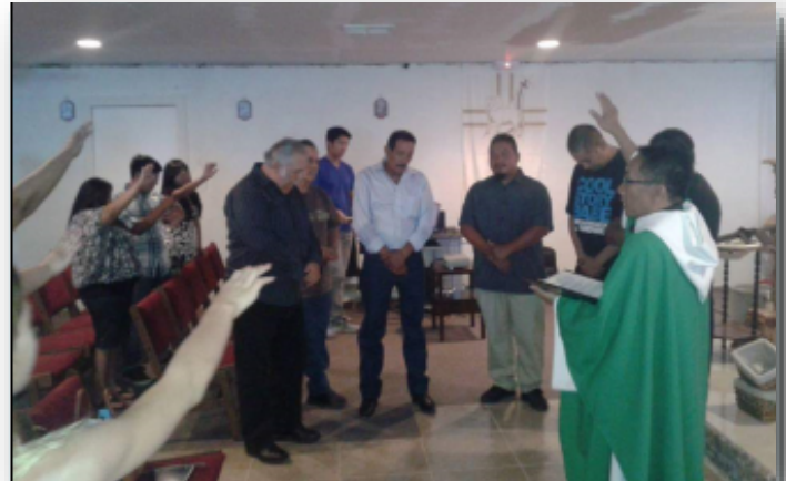
Father's Day Celebration during the Mass